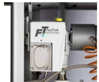
FasTrak is a smart positioner and it has a high-capacity and high-precision digital-pneumatic valve controller that replaces a conventional positioner.