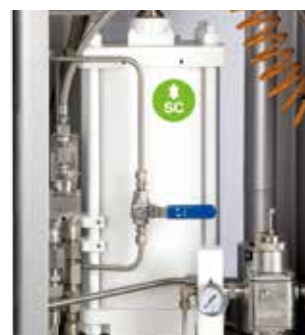
SC actuators are suitable for service in harsh environments such as desert areas.

The patented lubrication system consists mainly of a grease lubricant filled annular cavity placed inside the cylinder piston, between a sealing ring and a sliding ring to avoid direct contact between the metal surfaces of the piston and the cylinder, even in case of lateral forces acting on the actuator stem; the annular cavity is filled with grease which, during the piston movement, keeps the metal parts lubricated allowing very smooth sliding and a long seal life.