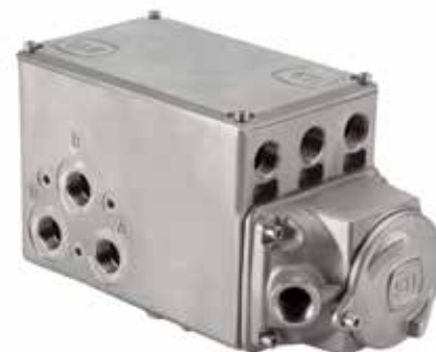
FasTrak is available in stainless steel 316 with explosion proof barrier