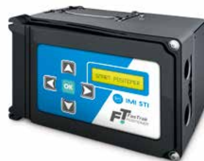
FT display version